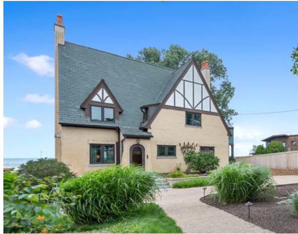
1920's Lakefront Home

See our beach cam and virtual tours at www.MillerBeach.com