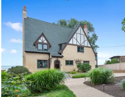
1920's Lakefront Home

See our beach cam and virtual tours at www.MillerBeach.com