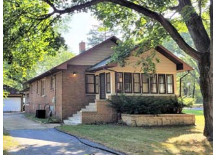
ZONED R-3 MULTI FAMILY