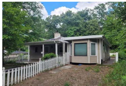
Lake Michigan just a short walk away