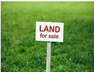
Large duneland parcel one block from Lake