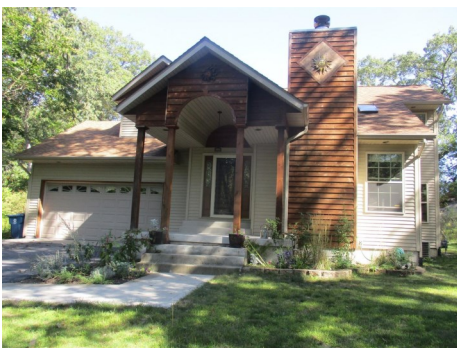
Dune top Getaway!