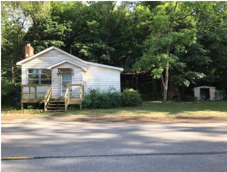
Block to Beach!

See our beach cam and virtual tours at www.MillerBeach.com