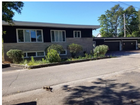
1 House from Lake Michigan!