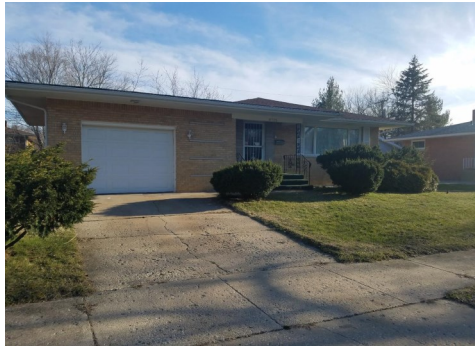
Quality Brick Ranch!